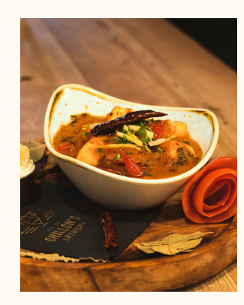
Soya 'Chicken' Curry 🌽

Soya mince curry cooked in desi sauce with natural herds & spices